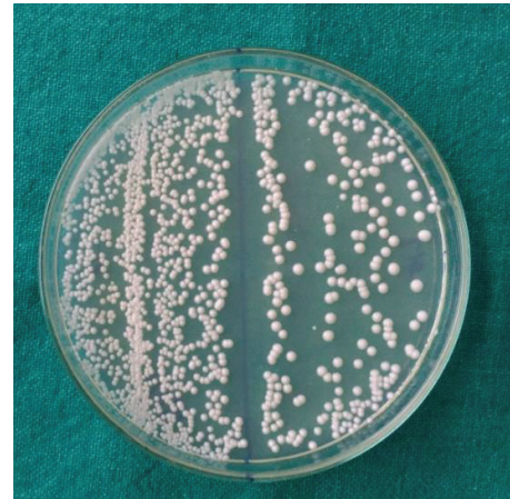
FIGURE 1: Candidal growth on SDA.

Suspensions of C. albicans were prepared in saline solution adjusted to the turbidity of 0.5 McFarland and streaked onto Mueller-Hinton agar supplemented with 1% glucose evenly. Then the discs of chlorhexidine, coconut oil, probiotics, and ketoconazole are placed on its surface at equal distance. This was done for all the 20 isolates of Candida . Then the plates were incubated at 37°C for 24 hours and observed for the zone of inhibition around the disc (Figure 2), which will be measured and compared.